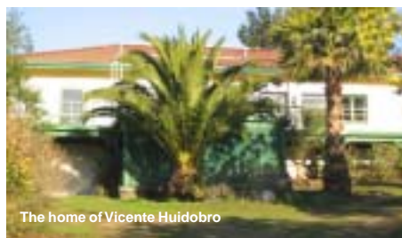
The home of Vicente Huidobro

The route also includes three National Monuments: the tomb of poet Vicente Huidobro – considered one of the four greats of Chilean poetry, along with Pablo Neruda, Gabriela Mistral and Pablo de Rokha – who lived in this city; the coastal zone