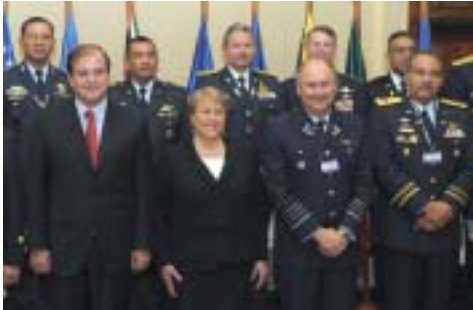
President Michelle Bachelet at the opening ceremony of the 49th Conference of Chiefs of the American Air Forces.